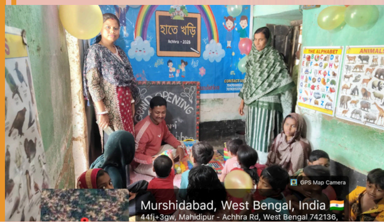
Murshidabad, West Bengal, India 🇮🇳 44fj+3gw, Mahidipur - Achhra Rd, West Bengal 742136,