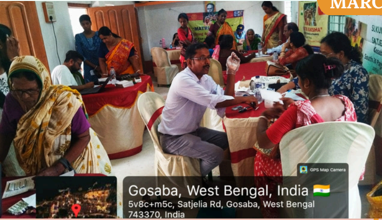
Gosaba, West Bengal, India 🇮🇳 5v8c+m5c, Satjelia Rd, Gosaba, West Bengal 743370, India